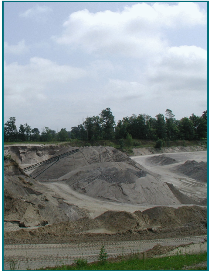
Sand and Gravel operation on Oak Ridges Moraine

If you have recently received your notice we can help you with the preparation of your Site Plan.